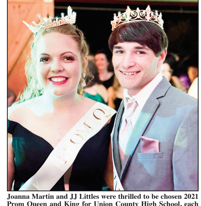
Prom Queen and King for Union County High School, each receiving a crown to commemorate the occasion Saturday night.

Prom was held at The See UCHS Prom, Page 6A