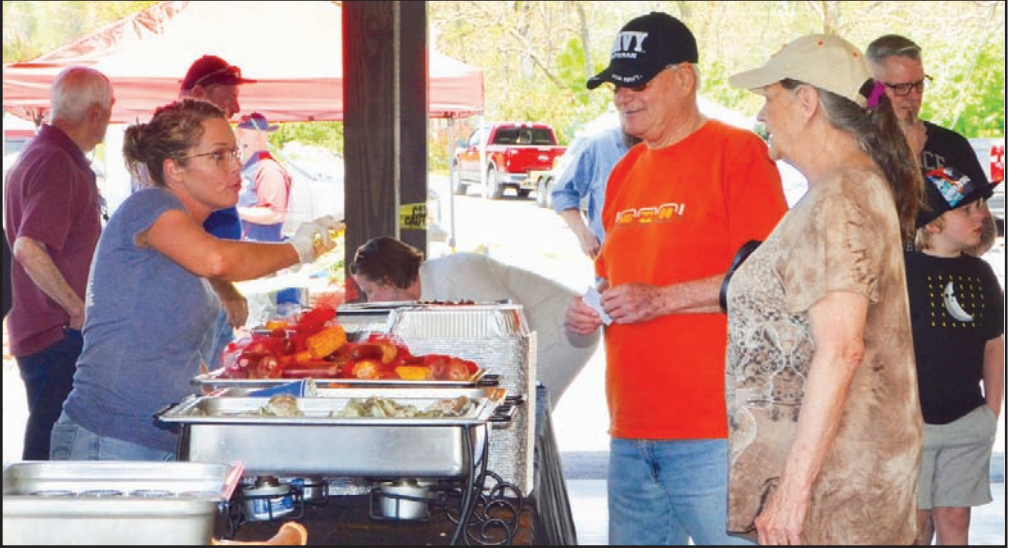
Allegheny Masonic Lodge hosted an incredibly well attended Low Country Boil on Saturday, bringing people from far and wide to support the delicious fundraising effort.